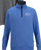
1/4 ZIP PERFORMANCE PULLOVER UNISEX SIZES: XXS - 6XL