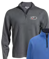
1/4 ZIP COTTON BLEND SWEATER UNISEX SIZES: XS - 5XL