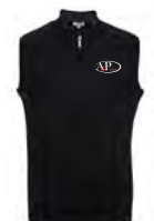
1/4 ZIP ACRYLIC VEST UNISEX SIZES: XS - 5XL

100% ACRYLIC AVAILABLE IN MULTIPLE COLORS