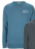
JERSEY KNIT COTTON SWEATER UNISEX SIZES: XS - 5XL

85% COTTON/ 15% NYLON AVAILABLE IN MULTIPLE COLORS