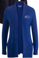
SHIRTTAIL OPEN SHAWL CARDIGAN LADIES SIZES: XS - 4XL