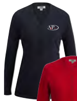
SHIRTTAIL COTTON CARDIGAN LADIES SIZES: XS - 4XL

PRICE INCLUDES SET-UP, UP TO 10,000 STITCHES ON FRONT LEFT AND UP TO 2,500 STITCHES FOR NAME/TITLE ON THE FRONT RIGHT