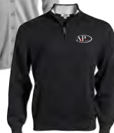
1/4 ZIP JERSEY KNIT SWEATER UNISEX SIZES: XS - 5XL

100% ACRYLIC AVAILABLE IN MULTIPLE COLORS