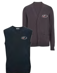
JERSEY KNIT V-NECK COTTON SWEATER VEST UNISEX SIZES: XS - 5XL

87% COTTON/13% NYLON AVAILABLE IN MULTIPLE COLORS