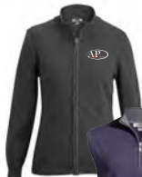
FULL ZIP COTTON CARDIGAN LADIES SIZES: XS - 4XL