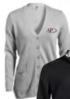
JERSEY KNIT LONG CARDIGAN WITH POCKETS LADIES SIZES: XS - 3XL

87% COTTON/13% NYLON AVAILABLE IN MULTIPLE COLORS