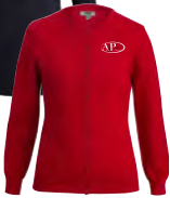
JEWEL COTTON CARDIGAN LADIES SIZES: XS - 4XL